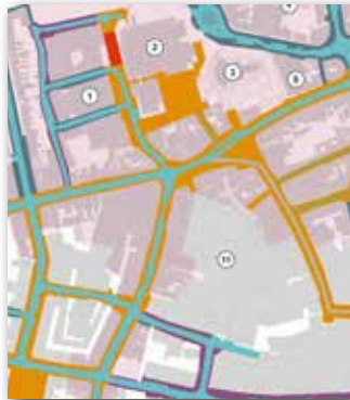
Wolverhampton Public Realm Design Guide extract