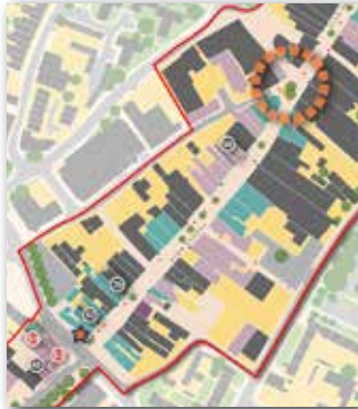
Poole HAZ Projects Map extract

(see my Portfolio for further information)