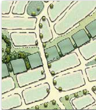
Masterplan extract for 1,000+ homes